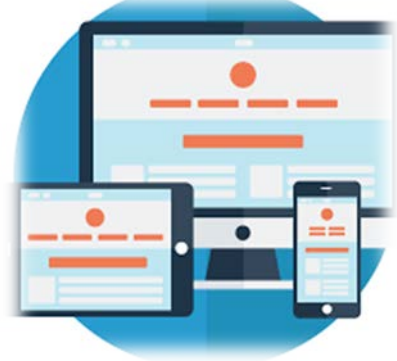
Other Industry Disruptor Models