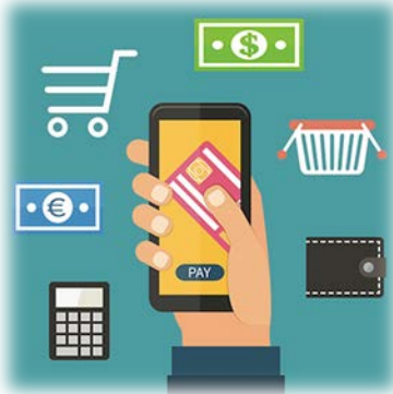
Digital Commerce & Payments