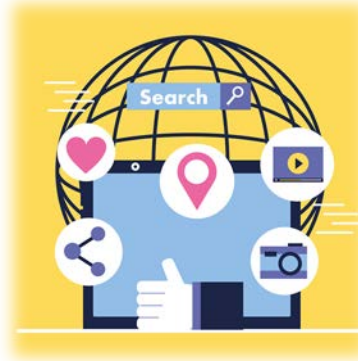
Digital Entertainment & Content